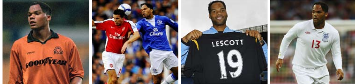
FROM LEFT TO RIGHT: Early days at Wolves; his final, ill-fated appearance for Everton in August; signing for Manchester City and strutting his stuff for England against Brazil in Qatar